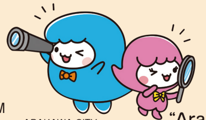
ARAKAWA CITY SYMBOL CHARACTER "Arami" ©ARAKAWA CITY 2012#H25-0023 ©ARAKAWA CITY 2010#H25-0023