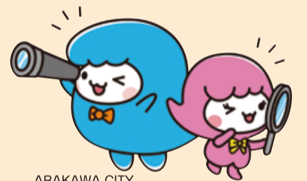
ARAKAWA CITY SYMBOL CHARACTER "Arabou" "Arami" ©ARAKAWA CITY 2012#H31-0027