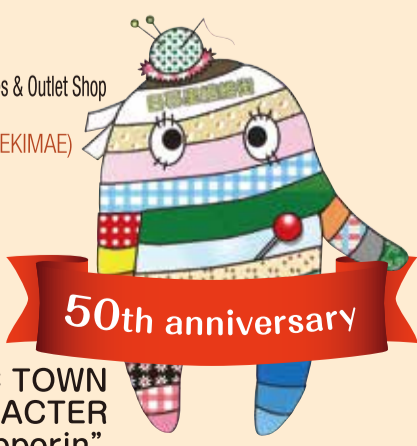
NIPPORI FABRIC TOWN MASCOT CHARACTER "©Nipporin"